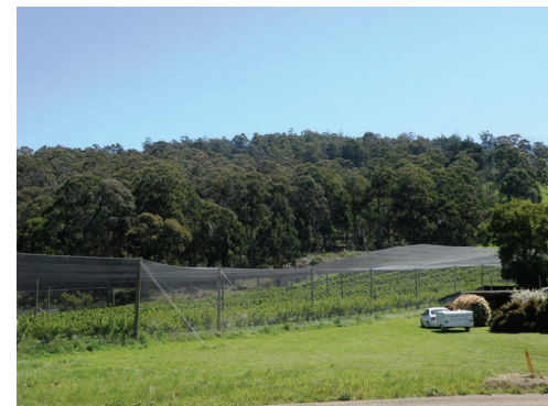
Wildlife corridors provide avenues for movement, and at a larger scale, food and nest sites in strips of native habitat within a matrix of unfavourable habitat, such as agricultural and cleared land.

A number of corridors, at continental and regional scales, are also being established in Australia, including The Great Eastern Ranges Initiative , Gondwana Link , Habitat 141 o , and the Trans-Australia Eco-Link , as well as other smaller scale corridor and buffer projects (e.g. Naturelinks ).