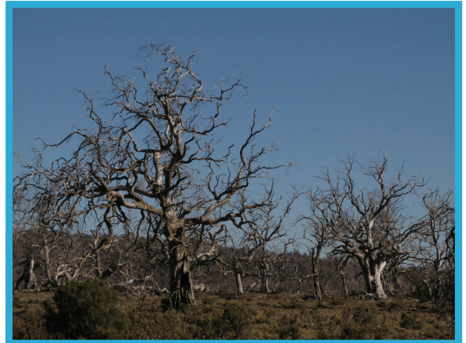
Dieback of Miena Cider Gum at Barren Tier in the Central Plateau, Tasmania

Examining climate change projections modelled by the ACE CRC Climate Futures for Tasmania project suggested that the distribution of climatically suitable habitat for Miena cider gum may shift to areas of higher altitude and rainfall to the west of its current range. By 2100 temperatures will exceed the current range of the species throughout its present range and will have reduced the area of climatically suitable habitat to a small climate refuge in the western part of the central plateau. This prediction has implications for the future recovery program for the species.